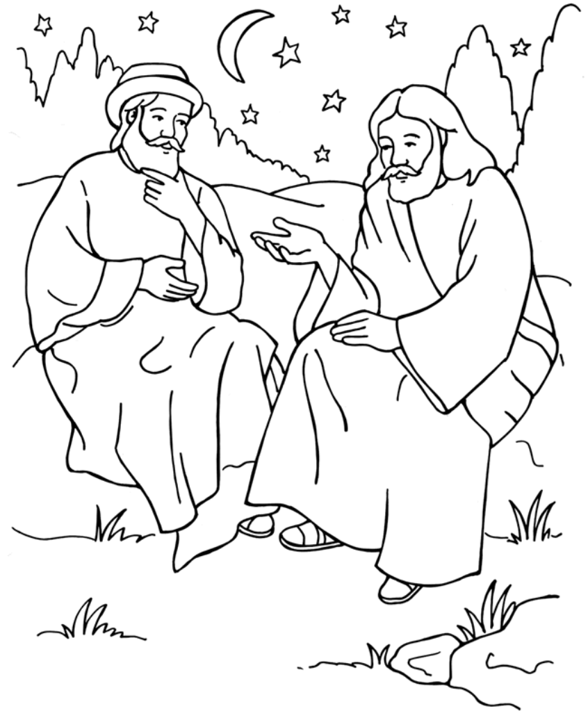
Jesus and Nicodemus John 3